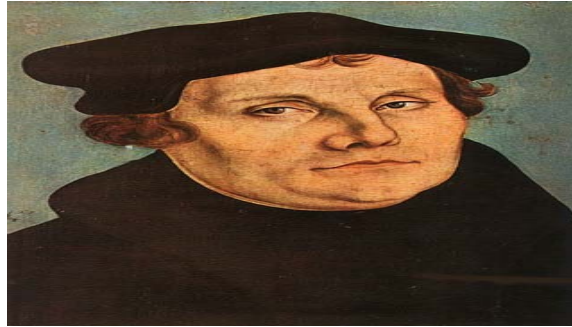
Martin Luther 1483-1546

**Foremost among those who were called to lead the church from the darkness of Popery into the light of a purer faith, stood Martin Luther. Zealous, ardent, and devoted, knowing no fear but the fear of God, and acknowledging no foundation for religious faith but the Holy Scriptures, Luther was the man for his time; through him God accomplished a great work for the reformation of the church and the enlightenment of the world**